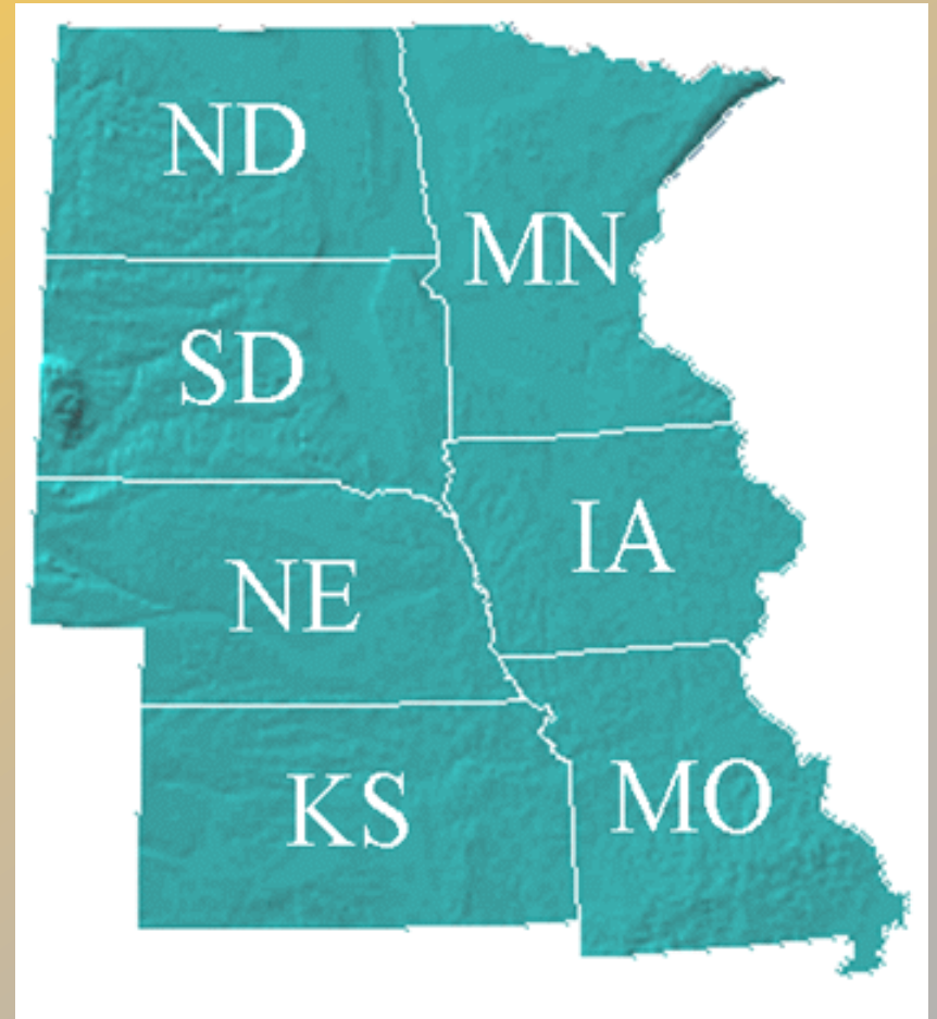
The Great Plains