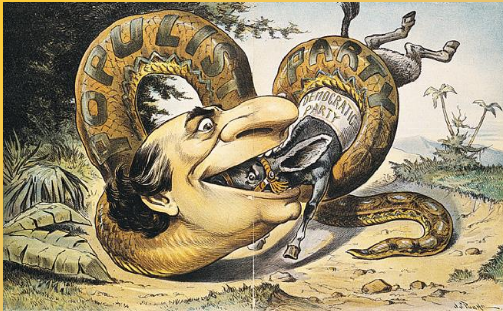
Historical cartoon of Populist Party as a snake with William Jennings Bryan's head swallowing donkey of the Democratic Party