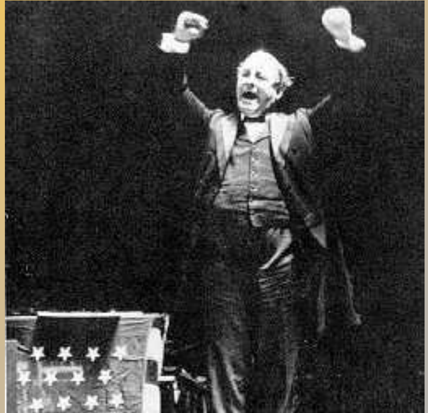
July 9, 1896, at the Democratic National Convention, Chicago