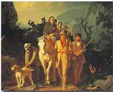
Even after Britain issued the Royal Proclamation of 1763, Daniel Boone continued to settle areas west of the Appalachian Mountains. This 1851 painting, Daniel Boone Leading Settlers through the Cumberland Gap , depicts the popular image of a confident Boone leading the early pioneers fearlessly into the West.

King dismisses petition of First Continental Congress, 1775